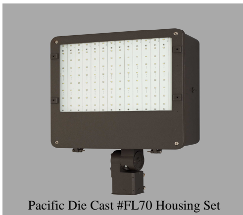
Pacific Die Cast #FL70 Housing Set

The Alta 70, 100, and 140 watt LED kit is designed for all customers that purchase the Standard FL70 Die Cast Aluminum fixture housing set from Pacific Die Cast Company. The 3 different LED kits include all the components necessary to create a complete LED post top or trunion mount flood fixture. These kits will mount up to existing housing screw holes.