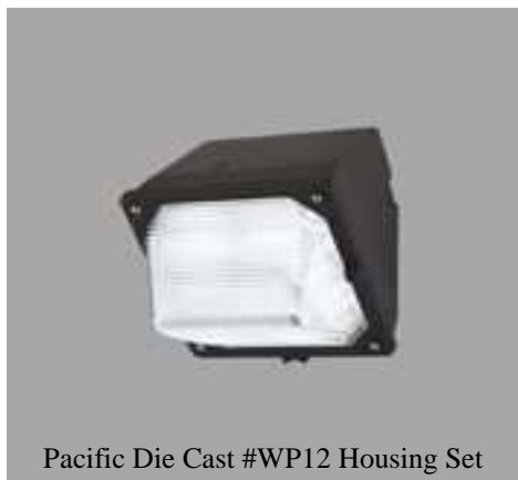
Pacific Die Cast #WP12 Housing Set

The Alta 18, 27, 36 watt LED kit is designed for all customers that purchase the Standard WP12 Die Cast Aluminum fixture housing set from Pacific Die Cast Company. The 3 different LED kits include all the components necessary to create a complete LED Small Wallpack fixture. These kits will mount up to existing housing screw holes.