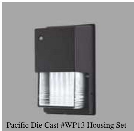
Pacific Die Cast #WP13 Housing Set

The Alta 18, 27, 36 watt LED kit is designed for all customers that purchase the Standard WP13 Vertical Die Cast Aluminum fixture housing set from Pacific Die Cast Company. The 3 different LED kits include all the components necessary to create a complete LED Wallpack fixture. These kits will mount up to existing housing screw holes.