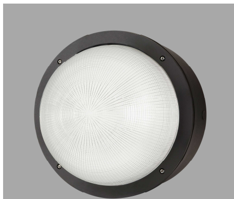
Pacific Die Cast #WPR40OF Housing Set

The Alta 20, 36, 50, and 65 watt LED kit is designed for all customers that purchase the Standard WPR40OF Die Cast Aluminum fixture housing set from Pacific Die Cast Company. The 4 different LED kits include all the components necessary to create a complete LED Open Face Bulkhead fixture. These kits will mount up to existing housing screw holes.