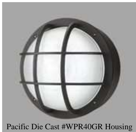
Pacific Die Cast #WPR40GR Housing

The Alta 20, 36, 50, and 65 watt LED kit is designed for all customers that purchase the Standard WPR40GR Die Cast Aluminum fixture housing set from Pacific Die Cast Company. The 4 different LED kits include all the components necessary to create a complete LED Grid Bulkhead fixture. These kits will mount up to existing housing screw holes.